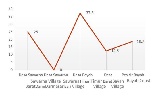
Fig 2. Disaster Education Capacity Level

Disaster education capacity can be seen from 4 aspects (1) Access to disaster information, (2) Education and training, (3) Research methods, and (4) Disaster-resilient culture strategies. Disaster education capacity level can be seen on Figure 2.