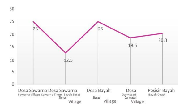
Fig 4. The Level of Preparedness Capacity on All Lines

The capacity of preparedness in all lines can be known from aspects (1) Disaster management mechanisms, (2) Contingency plans and regular training, (3) Financial and logistical reserves, and (4) Post disaster review procedures. Preparedness is an activity which is active protection when a disaster occurs and provides short-term solutions to provide support for long-term recovery. The level of preparedness capacity on all lines can be seen on Figure 4.